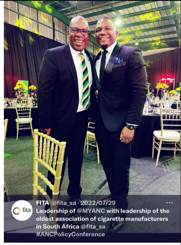
ANC Gauteng Chairperson and FITA chairperson