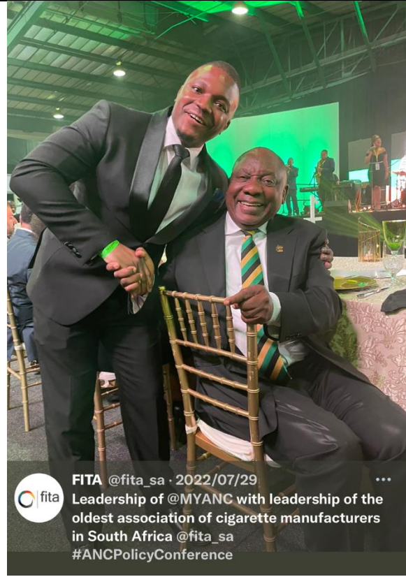
State President and the FITA chairperson